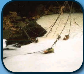
Soap Suds or Foam