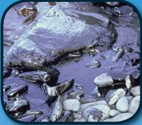
Oil Sheen on Shoreline