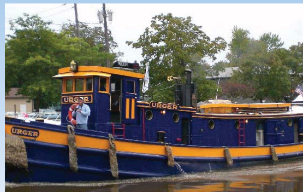
The Canal Corporation's historic Tug Urger on the Erie Canal